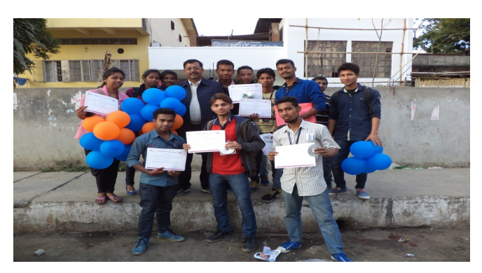
Some Snapshots of Mock drill of TEMEX