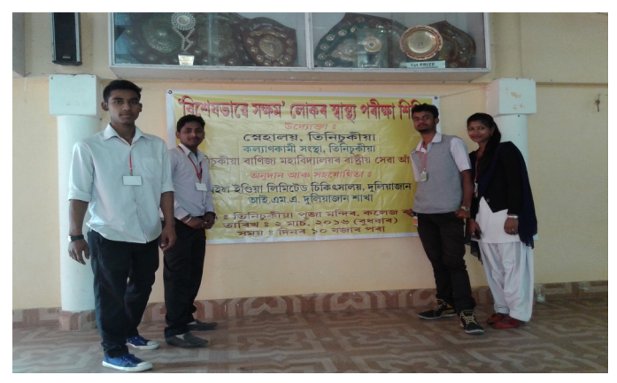
Some snapshots of free Health Checkup Camp for Persians with Disability