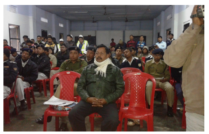
Some snapshots of Search & Rescue training